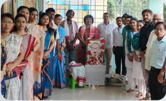
FOUNDATION DAY- 1 st September